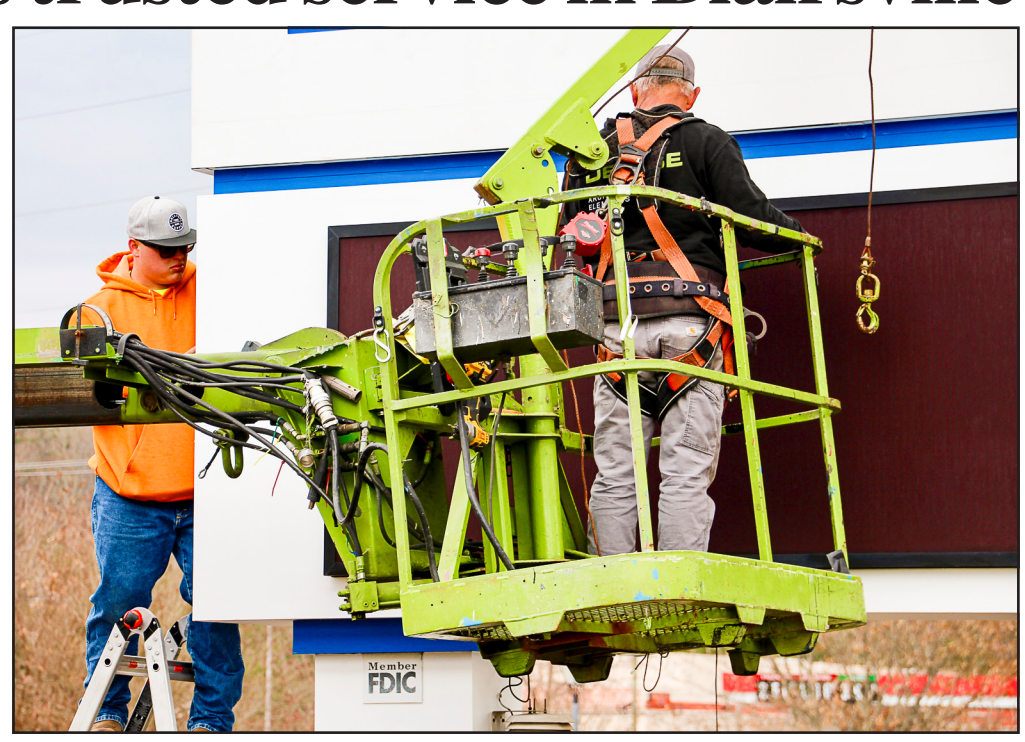
A sign crew working Monday to swap out the signage at the United Community Main Branch on Georgia 515 in Blairsville.