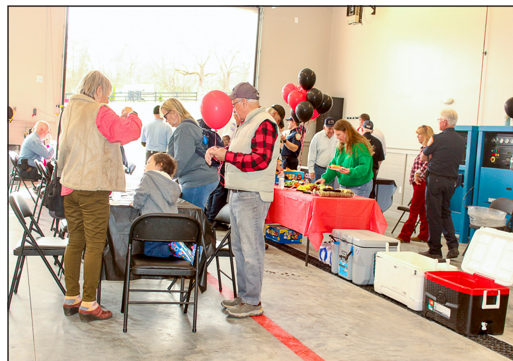
Members of the community enjoyed attending the grand opening, not only to check out the capabilities of the new Fire Station 13, but also for the complimentary food and fixings.